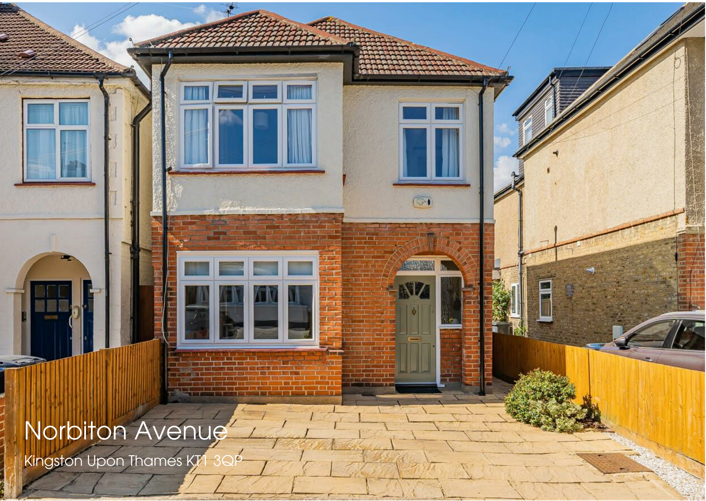
Norbiton Avenue Kingston Upon Thames KT1 3QP

34 Richmond Road Kingston upon Thames Surrey KT2 5ED www.gibsonlane.co.uk Tel: 020 8546 5444